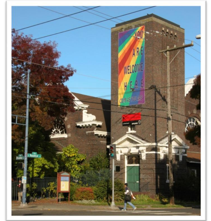
The front of our building at Broadway & Republican

We have such a good thing going that we just can't keep it secret. Our unique community is like a brilliant lamp that can't be kept hidden — we want it to shine out for the whole world to see. We're the new pilgrims, looking to the future and planning our spiritual journeys together.